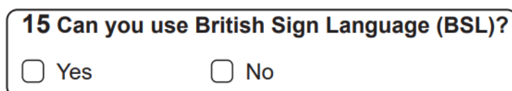
Figure 6: 2022 Census – British Sign Language question

The British Sign Language question should be answered for everybody who is aged 3 or over.